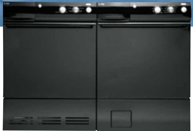
UltraCare Family Laundry System